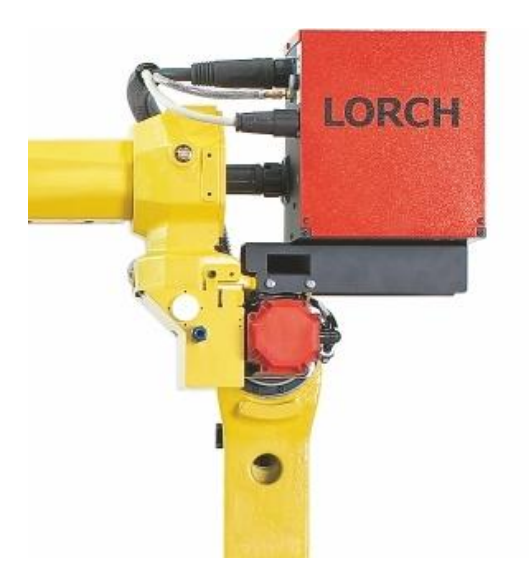
Lorch Feed 1 & 2